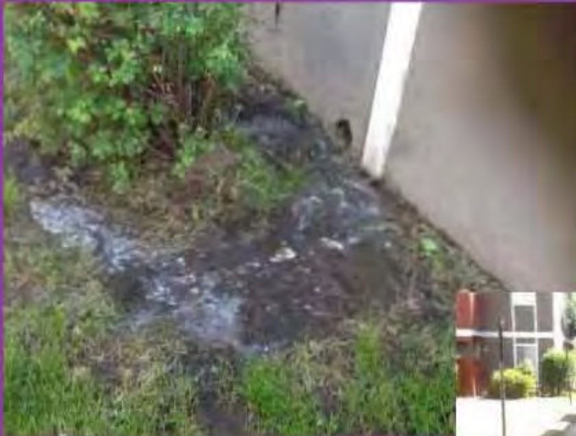
Raw sewage Impacting common areas