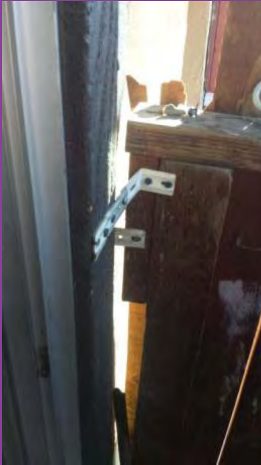
Improper balcony repair