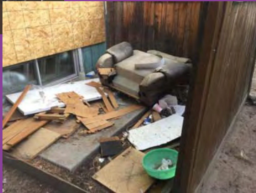
Vacant unit left unsecured Garbage and debris