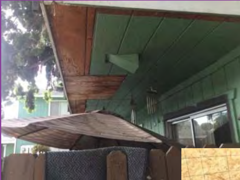
Unpermitted balcony repair